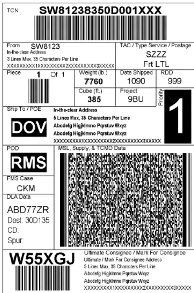
Figure C-1. Sample MSL

This 2D symbol contains data for the MSL, TCMD, and 10 supply line items.