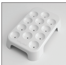
Cooling Rack and Cake Pops Stand (2)