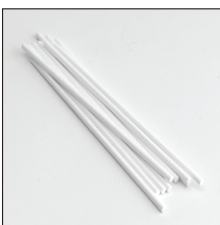
Cake Pops Sticks