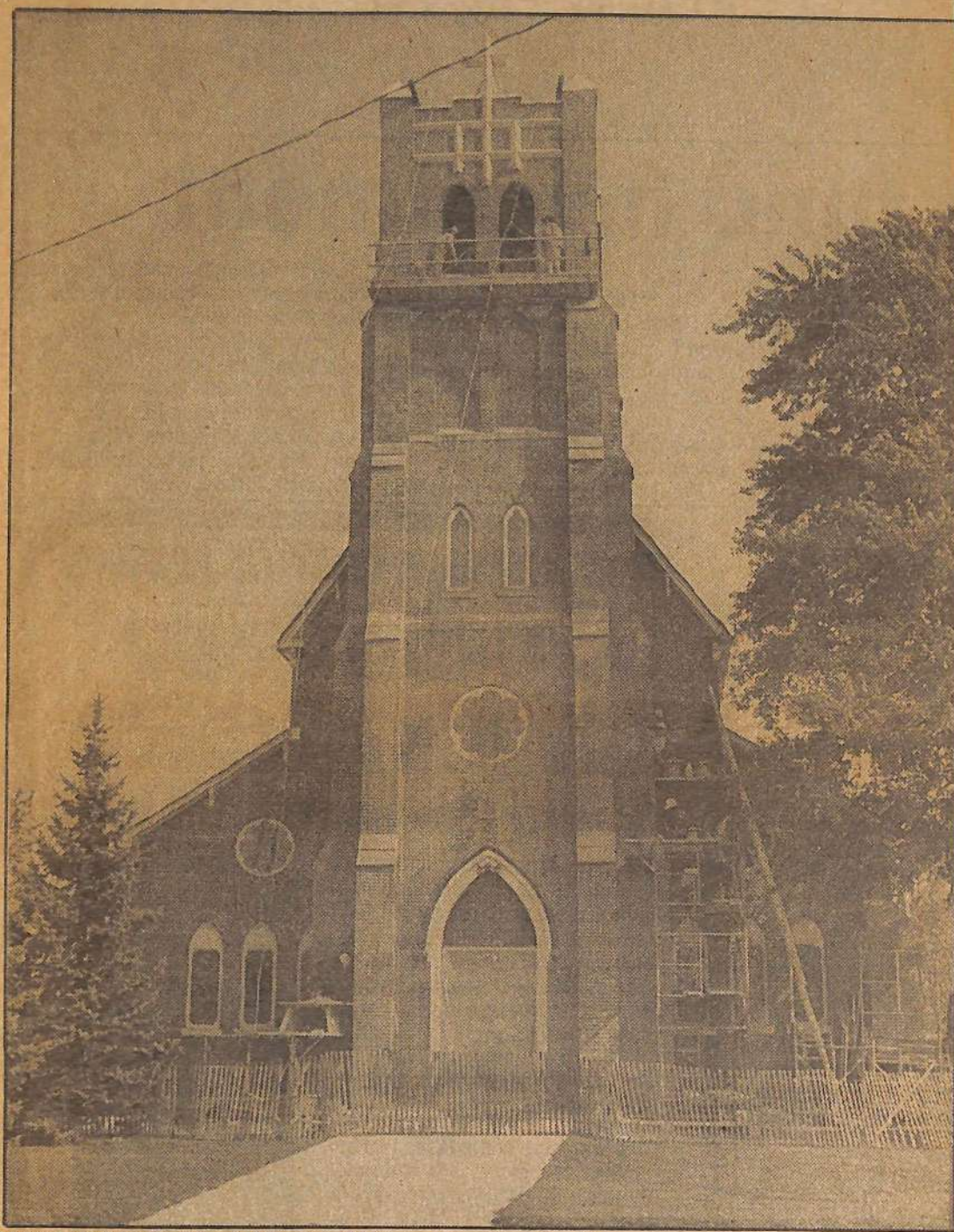
109-YEAR-OLD St. Mary's Church in Maidstone is getting a facelift