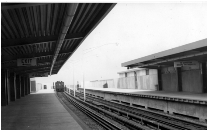
The Broad Channel station, after subway service began.