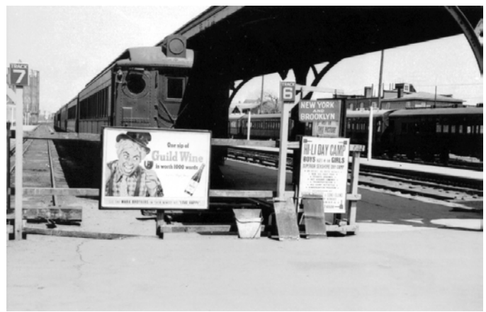
The Rockaway Park station, circa 1950.