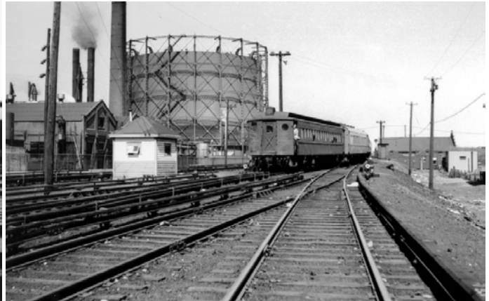
Another Long Island Rail Road train enters Rockaway Park Yard about 1950.