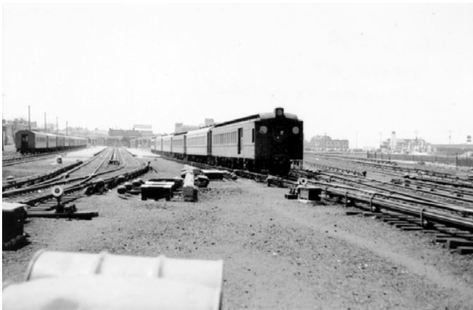
Another view of Rockaway Park Yard, circa 1950.