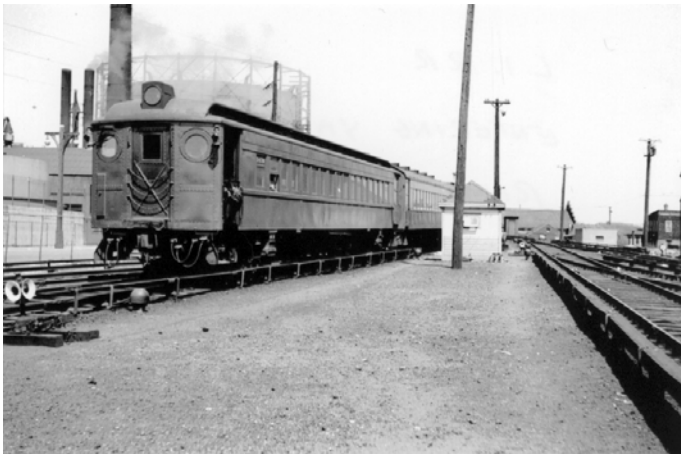
A Long Island Rail Road train enters Rockaway Park Yard about 1950.