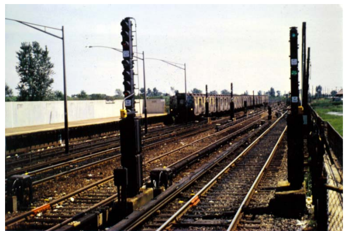
View south from Howard Beach, outbound platform, August 13, 1986.